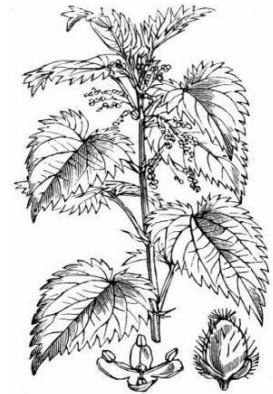
905 Urtica dioica L. Common Nettle ; G.